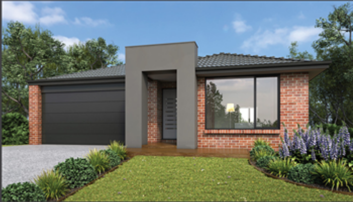
Image used for illustrative purposes. *Price based on facade type shown. Price excludes options/upgrades such as roof upgrades, render, feature front doors, garage doors, window furnishings, light fittings and items not supplied by Dennis Family Homes such as decking, landscaping and fencing unless otherwise specified.